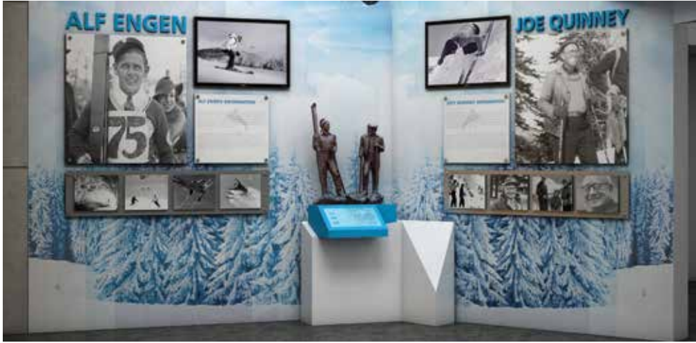
Proposed grand entry