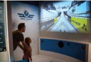
Dad helps daughter at Virtual Ski Jump Exhibit