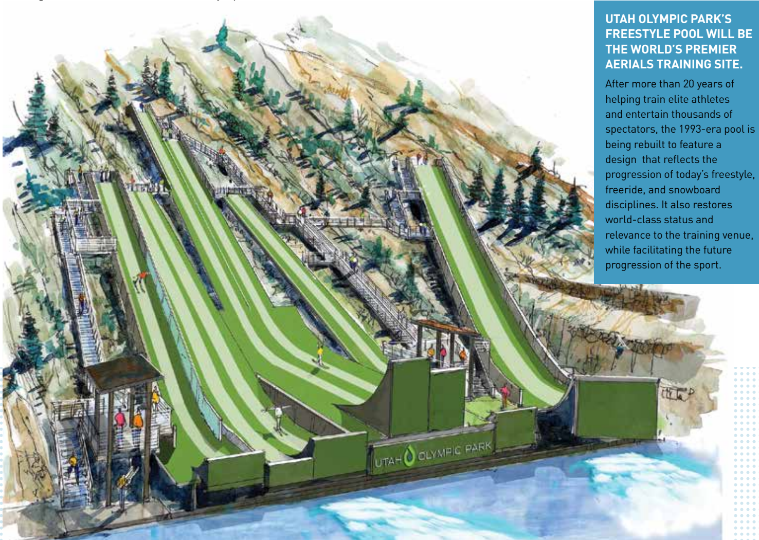
Artists rendering of new splash pool and ramps

Exciting times are at hand at the Utah Olympic Park!