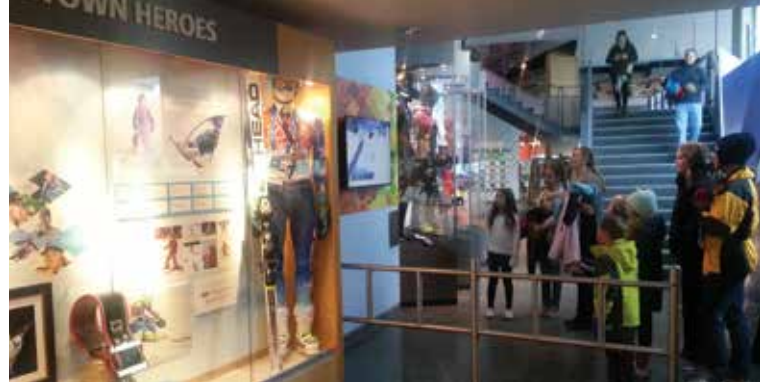
Guests enjoying Hometown Heroes Exhibit

Bronze medalist - Paralympic Alpine Skiing, Super Combined