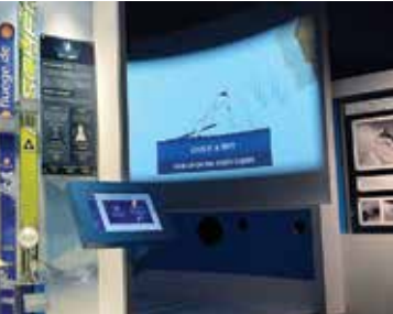
Close-ups detail features of Alf Engen's Take Flight exhibit.