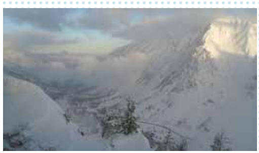
Little Cottonwood Canyon - inversion day