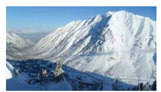
Little Cottonwood Canyon - clear day

We need your collective experience as skiers and outdoor enthusiasts to weigh in on the Blueprint. Did we get it right? Don't miss this opportunity to make a difference. The success of Mountain Accord and the way it moves forward and develops relies heavily on fair and balanced feedback from many perspectives. We're looking for meaningful feedback from all groups, disciplines and passions – including the skiing community. Only then can we be certain that the record truly and accurately reflects what is important to the public as a whole and how well the Blueprint addresses Mountain Accord's goals. Check out the full Blueprint at mountainaccord.com and tell us what you think!